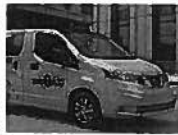
NYC Taxis Will Soon Get a New Look