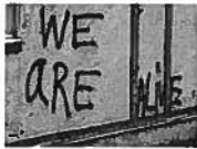
Ala. residents picking up the pieces