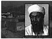
White House: Bin Laden Unarmed During Assault