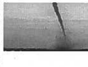
Giant waterspout seen spinning off Hawaii