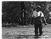
Flooding Leads to Evacuations in Memphis Area