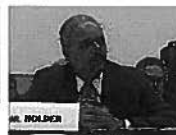
AG Holder grilled on ATF "gunwalker" controversy